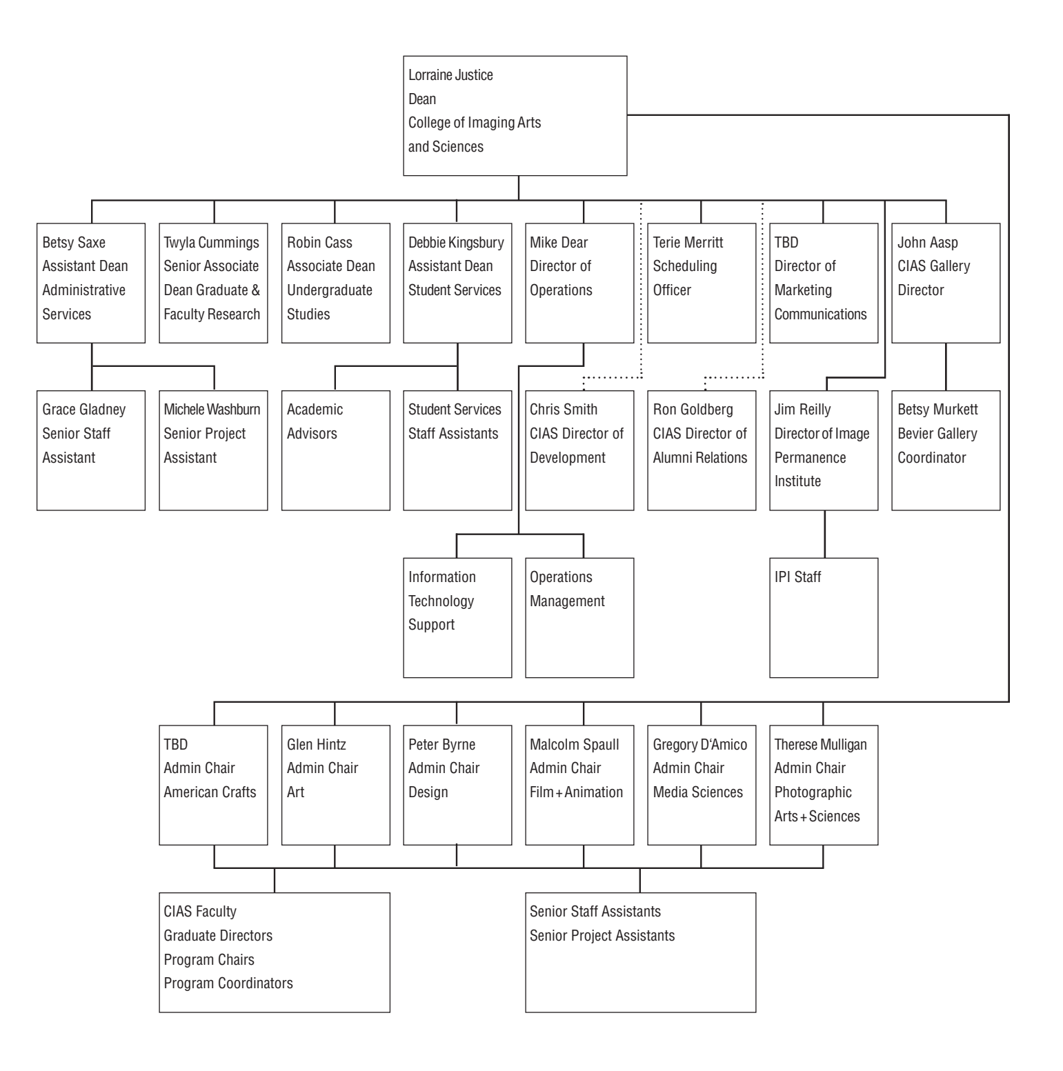
FIGURE 1 College of Imaging Arts and Sciences Organizational Structure